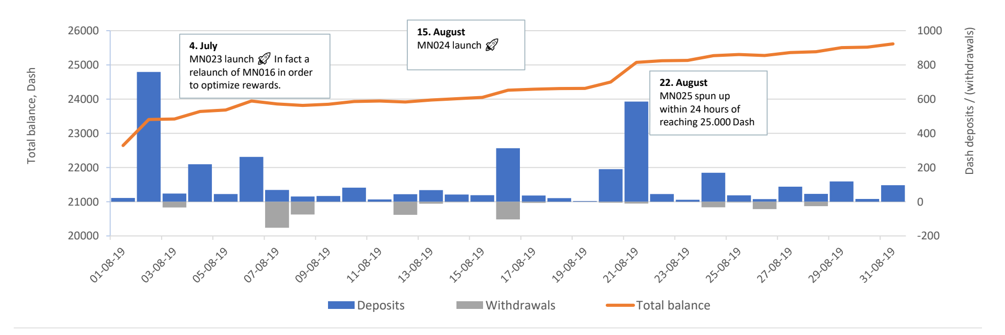
CrowdNode Transparency report – Aug19